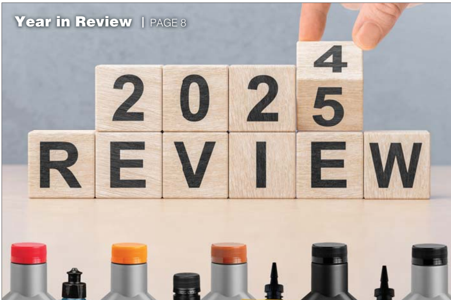
Year in Review | PAGE 8