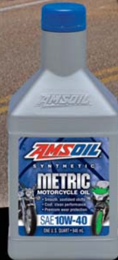
SYNTHETIC MOTOR OILS