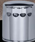
AMSOIL EA® FILTERS